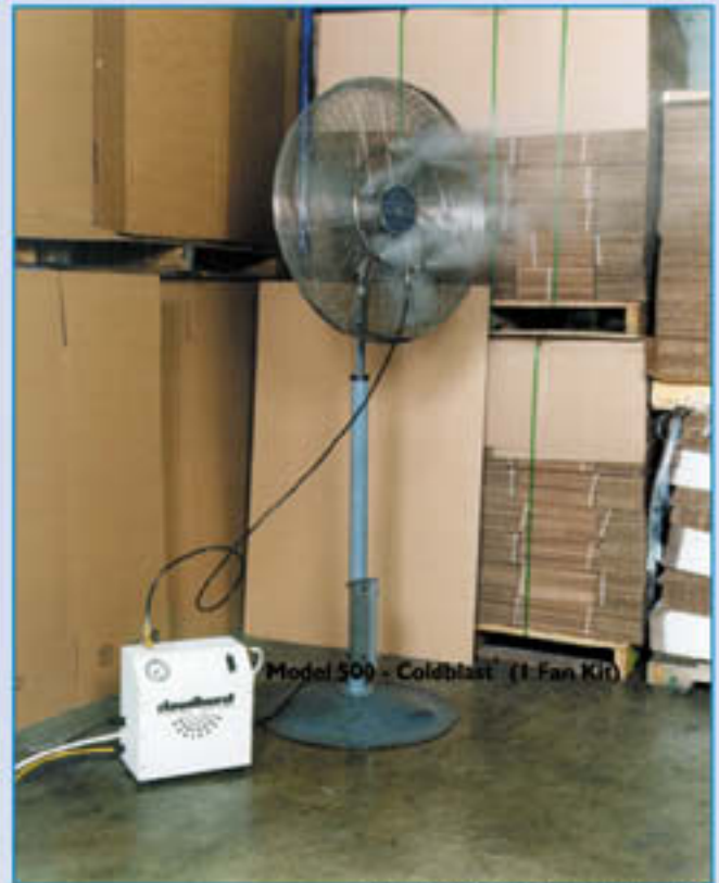
Model 500 - Coldblast® (1 Fan Kit)